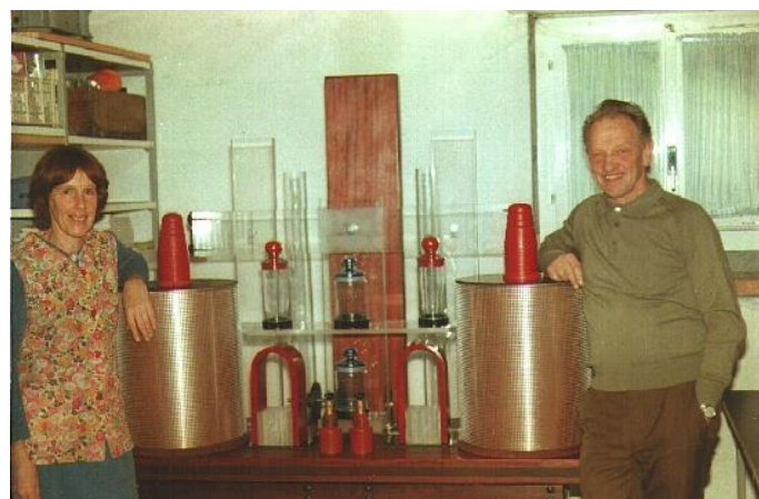
10 kW device in progress